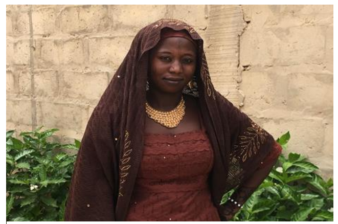
Youth leader that I interviewed about her initiatives to help reintegrate Boko Haram defectors.

My AFE experience consisted of two main components: an internship and an intensive course. I spent 10 weeks in Niamey, Niger as the Institutional Learning Team Intern for Search for Common Ground. In this position I supported the Design, Monitoring and Evaluation (DME) Specialist for West Africa and the Niger