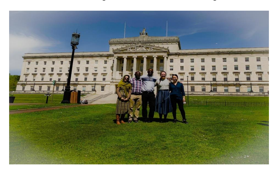
Rotary Peace Fellows in front of the Stormont Parliament in Northern Ireland

During our stay we held meetings with several people and institutions who are stakeholders in the conflict or are taking part in the peacebuilding process. The Paddy Campbell Black Cab Tours took us through some of the historical parts of the conflict and the peace walls. We had meetings with Ex-prisoners, an Ex-British military Officer who served in Northern Ireland during the time of the violent conflict. Furthermore, two victims of the conflict in Londonderry, one a Catholic and the other a Protestant gave an account of the lived experiences of the conflict. The day spent in Londonderry gave us more insight into the conflict and allowed us to see the scenes of the infamous 'Bloody Sunday'. There were also visits to the Northern Ireland Assembly in Stormont and a meeting with a member of the Policing Board.