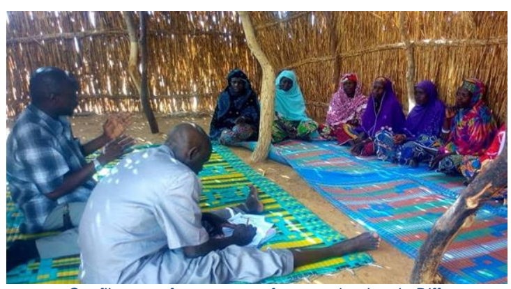
Conflict scan focus group of women leaders in Diffa

The process of conducting field research in a conflict-affected region taught me about research ethics and data security while the content taught me about the daily conflicts people are dealing with due to an ongoing state of insecurity. Working in the DME department in a peacebuilding organization helped me learn how to better integrate qualitative and quantitative data in order to measure progress on rather intangible topics like