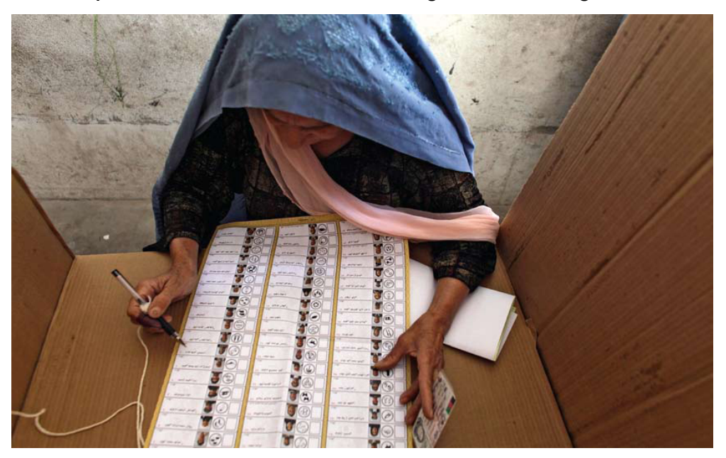
Figure 1: UN Photo by Tim Page entitled 'An Afghan citizen votes in the country's presidential and provincial coucil elections, Herat, Afghanistan. 20 August 2009'9